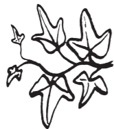
Ivy Unfading memory