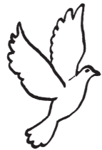
Rose Innocence, good