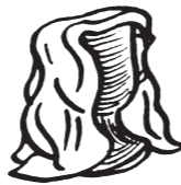
Cloth draped Urn Greek/Roman – death