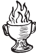
Flaming Urn New life